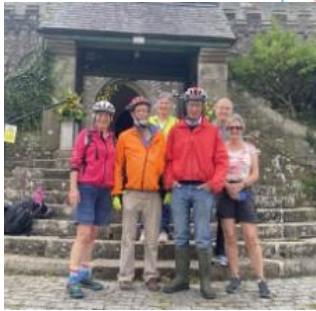
The Team gathers at the start of their sponsored walk from Ermington Church to Ugborough Church.