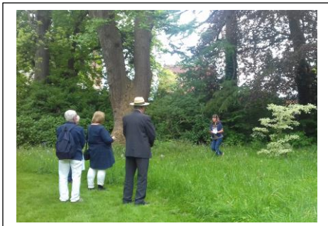
A kind and knowledgeable visitor correctly identified the Wedding Cake Tree – Cornus controversa Variegata.