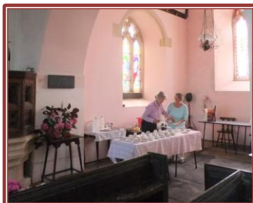
Concert refreshment preparation at Instow