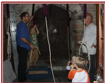
Bell Ringing lessons at Dolton